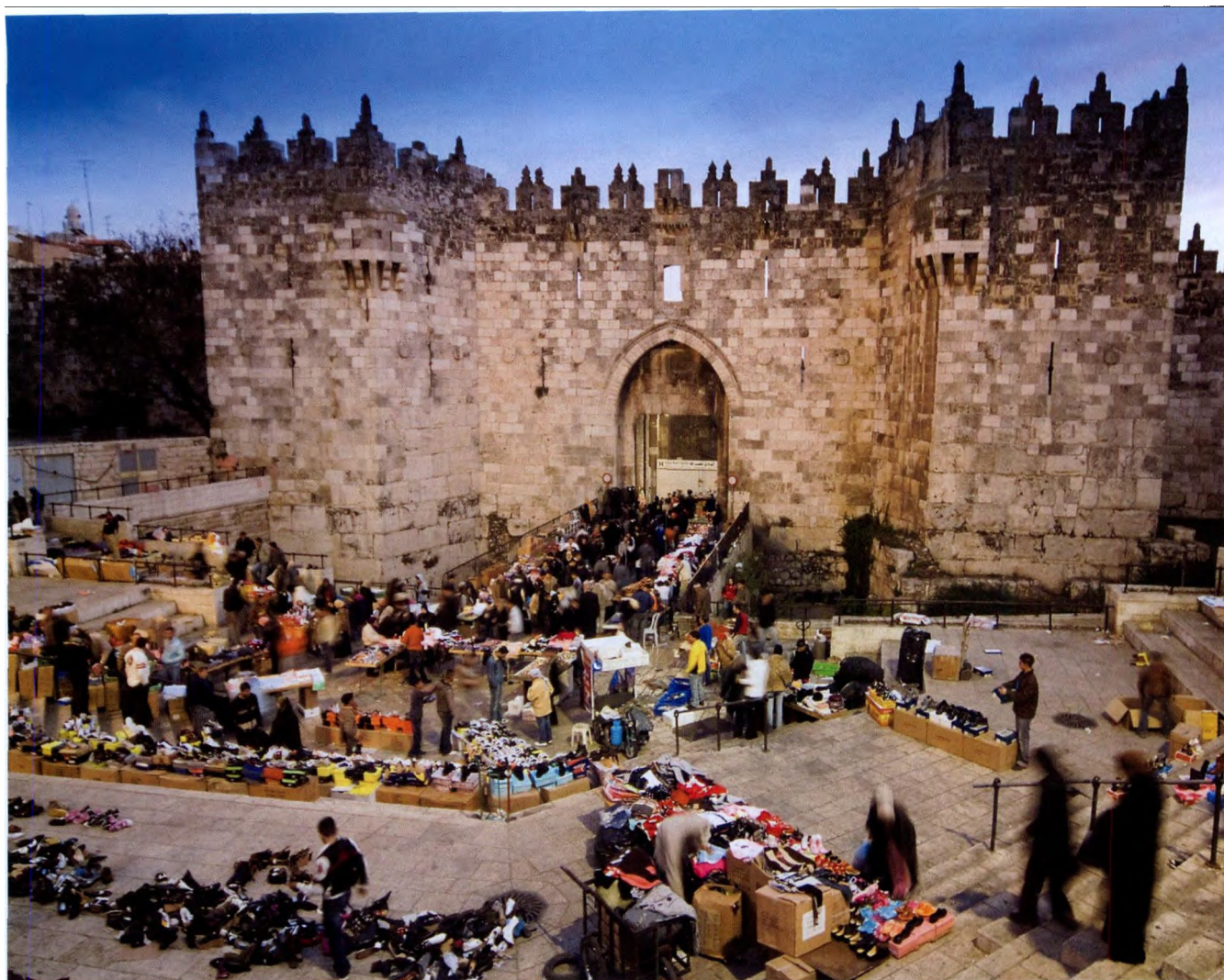
The Arabs usually choose Damascus Gate of Jerusalem to enter the city.

filled with small pieces of paper written with wishes. Nearby is telex service for those who cannot arrive in person for prey, where there will be someone folding the telexed prays into pieces of paper and fill it into the gaps. Wish is a good thing, the moment of which makes people full of hope though the wishes may not necessarily come true. Before entering the Wailing Wall plaza, visitors have to wear a white hat just like the pious prayers. Do not try to use the camera to shoot them when they think they are talking to the God. The Wailing Wall is divided into two parts, the left side is for men to pray facing the wall, and the right side is for women.