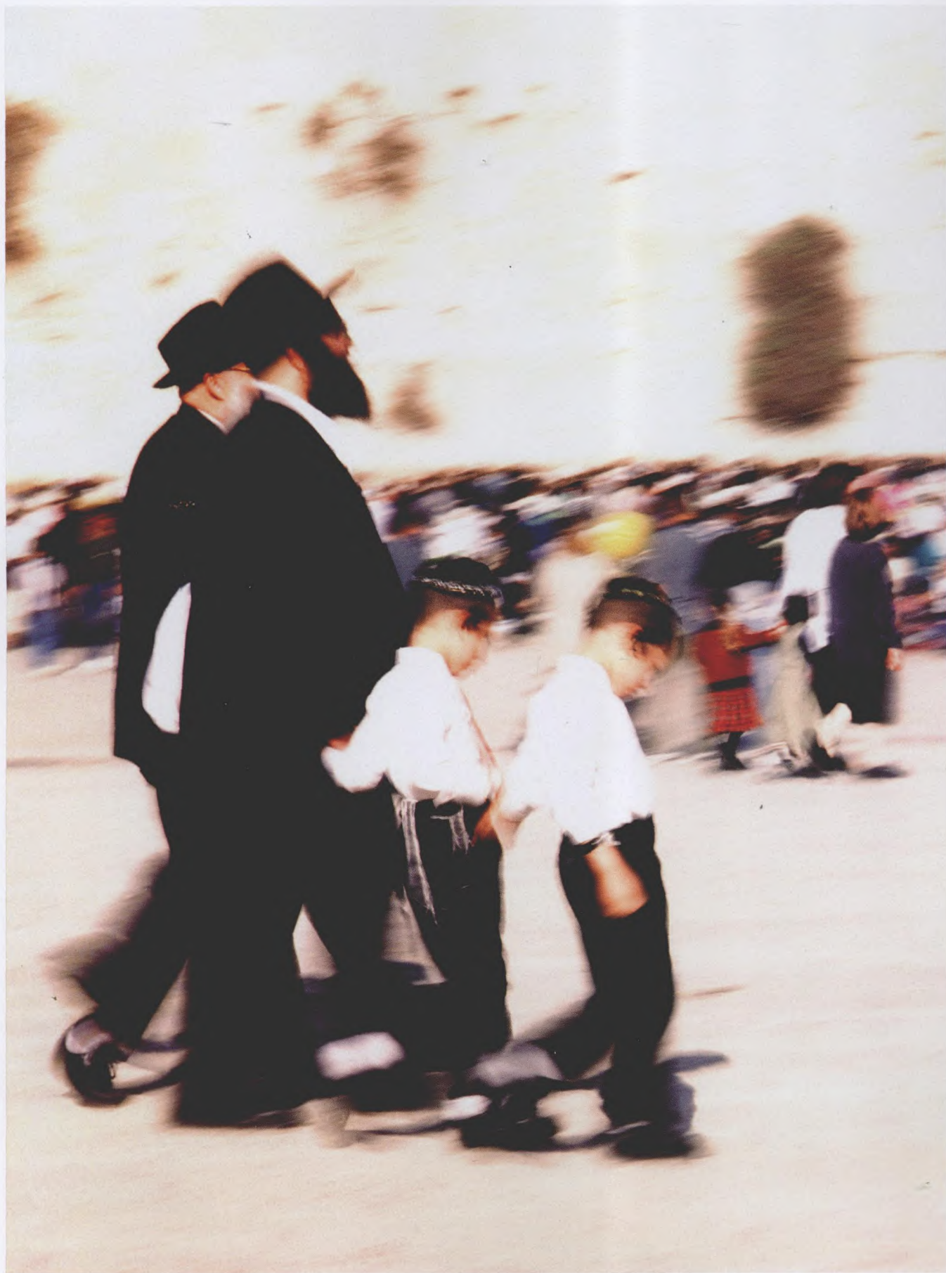
The Traditional Jews do not work, but study doctrine lifelong.